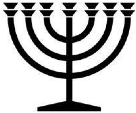
The Jewish Menorah

The Menorah is the symbol of the Trinity overlaid three times